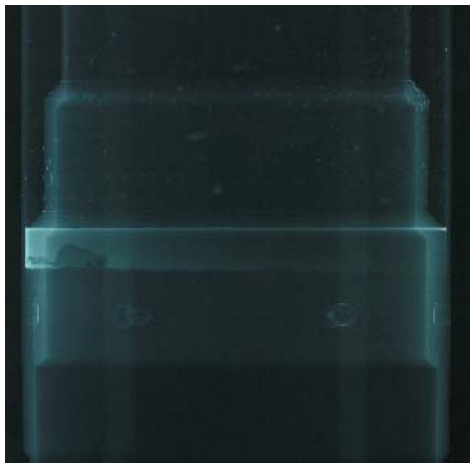
Figure 3. An example of the NR Inspection of the In-Pool Components having Cavities

irradiation facilities. Some of them were found to be inefficient and were not used. To increase the neutron flux in the holes used for the irradiation of targets, it was decided to insert plugs into the unused hole. The plugs having a cavity were made of Al and passed the x-ray inspection before the installation. Later, it was found that air bubbles rose from a plug due to a welding failure. As a measure to prevent the reoccurrence of this, a neutron radiography inspection is routinely performed for the in-pool components having cavities before a use. Figure 3 is an example of detecting the water inside an irradiation rig made of Al[2]. The brighter region at the center represents the water permeated into the cavity through a welding failure.