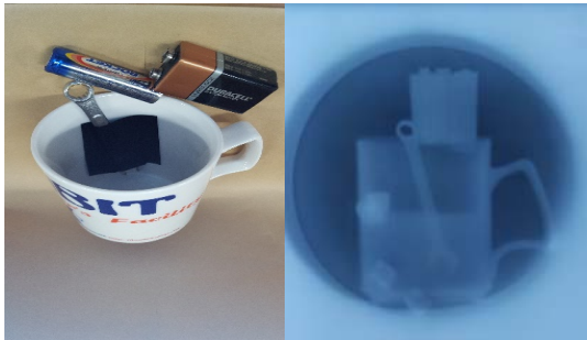
Fig.2 Photograph of a cup filled with water, a mini spanner, and batteries (left), and the fast-neutron imaging by film method in KSTAR tokamak (right).

For the fast-neutron imaging by film method, a film instead of the digital imaging device was also set on the end of collimator of neutron beam.