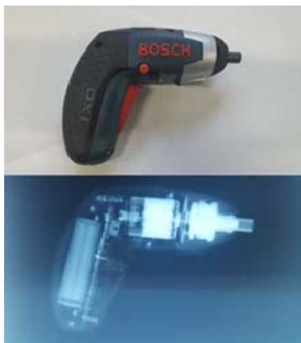
Fig.3 Photograph of a machine drill (upper), and the fast-neutron imaging by film method with the D-D neutron generator (lower).

With commercially available D-D neutron generator having neutron yield of 10^7 neutrons/sec, it was obtained the fast-neutron imaging with an industrial X-ray film. The imaging of machine drill is shown in Fig.3. It is also shown that the fast neutrons are passed with ease through a part of steels but are stopped by a kind of plastic resin.