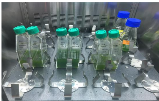
Fig.1. Cultivation of prepared cells before \text{Cs}^+ removal tests.

All experiments were carried out with Desmodesmus armatus SCK, which was isolated from wastewater treatment plant as cesium-accumulating microalgae. Cells used for the bioaccumulation system were cultured in TAP medium and incubated at 25 °C (Fig. 1).