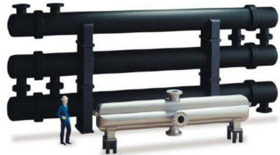
Figure 2. Size comparison of PCHE and shell and tube heat exchanger [2]