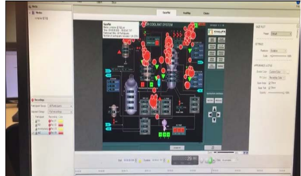
Figure 2. Eye tracking data analysis

We measured "Fatigue Subjective Symptoms Test" and various data related to eye tracking such as "Time to first fixation", "First fixation duration", "Fixation count", "Visit count", etc.