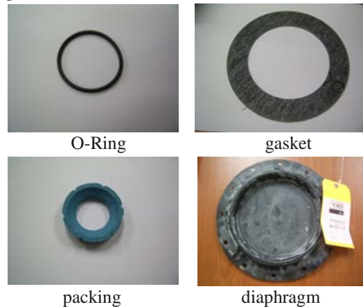
Figure 1. typical non-metallic components.

Figure 1 show the pictures of typical non-metallic components.