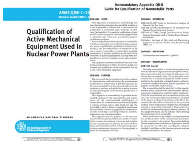
Figure 2. ASME QME-1 Appendix QR-B standard

Figure 3 shows ASME QME-1 Appendix QR-B standard.