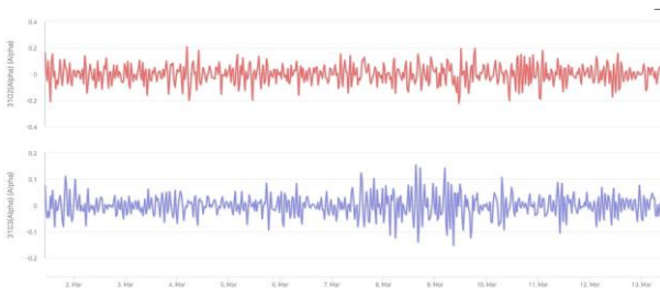
Fig 4 is the graph that shows the result of the experiment. From the graph results, the results are below the required value, indicating that the facility is safe in terms of radiation safety management.

The Experiment was performed for two weeks and the air ventilation fan operated only during the daytime.