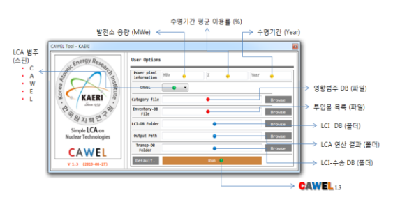
Fig. 2. User interface window of CAWEL ver3.1

Initial user interface of CAWEL is composed as user inputs specific data for selected uranium enrichment processes at the top line, and the remaining data are received through an prepared file. The results from CAWEL are provided in same format (see Fig. 2).