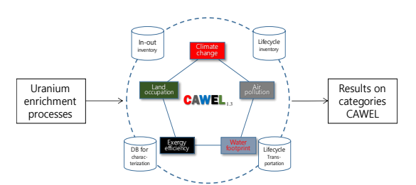
Fig. 1. Schematic information flows of CAWEL

The CAWEL model used in this study calculates five evaluation categories based on four databases. Both input/output data and calculation database are managed based on MS-Excel (see Fig. 1).