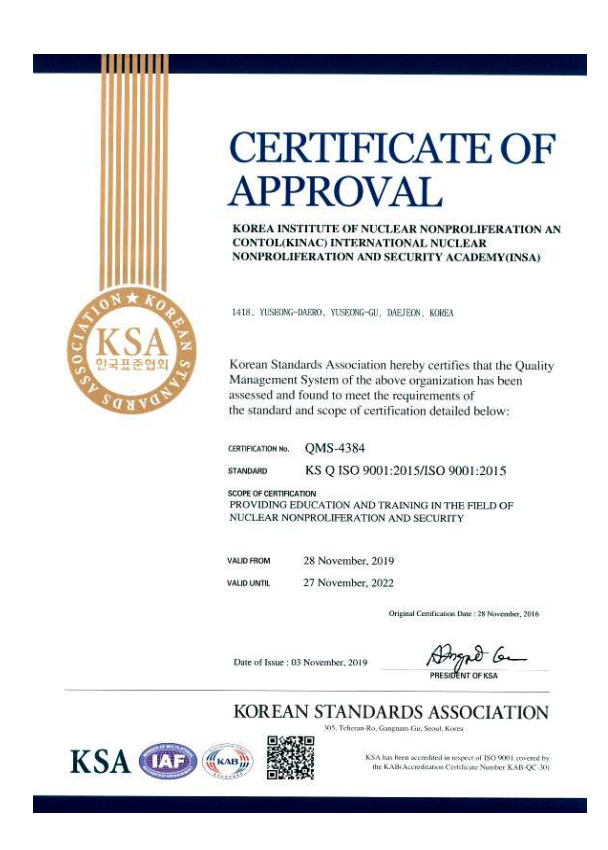
Figure 3. KINAC/INSA's ISO 9001:2015 Certificate of Approval