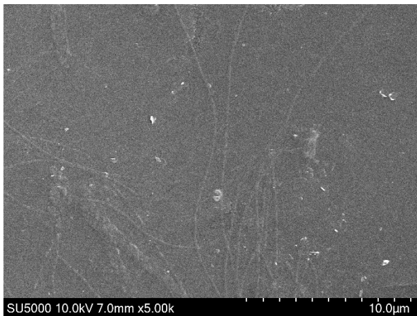
Fig. 2 Post-leaching test of cold-sintered amorphous aluminosilicate with cesium

The higher chemical durability was confirmed from the microstructure also. The post-leaching test surface of the cold-sintered matrix did not have any cracks or voids.