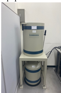
Fig 1. High Purity Germanium Detector

High purity germanium detector (Canberra Co. U.S) was used an analysis equipment for measuring radioactivity by nuclide. The equipment is P-type, which has a range of measuring within 50~2,000 keV and has a relative efficiency of 30% [4]. Marinelli Beaker was used as the measuring vessel, which was to increase the reliability of the analysis by measuring in the same form as the calibration standard source for the equipment.