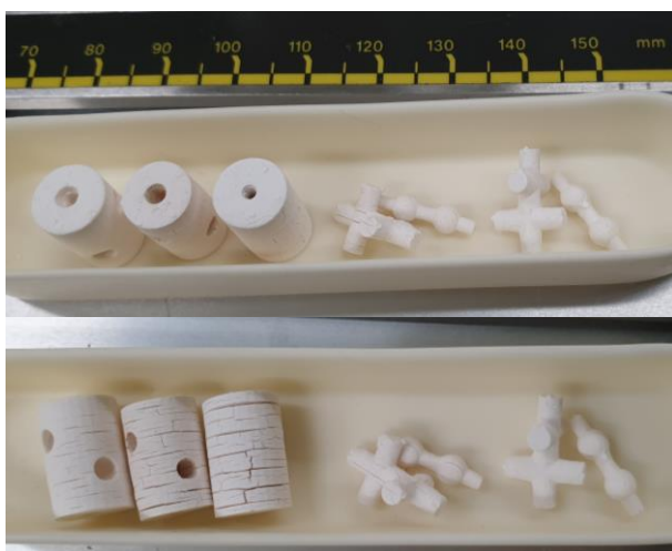
Fig. 4. Trial ceramic samples after firing under oxidative air atmosphere.

Figs. 3 and 4 show that cracks were developed throughout the structure that run parallel and normal to the build-up layers. These cracks may be formed due to the resin burnout or the residual stress induced by heterogeneity in ceramic power distribution, or sequential polymerization of resin.