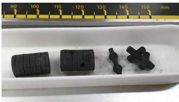
Fig. 3. Trial ceramic samples after firing under inert Ar atmosphere.

necessary to develop resins that are easily decomposed and vaporized at low temperatures in an inert or reductive atmosphere.