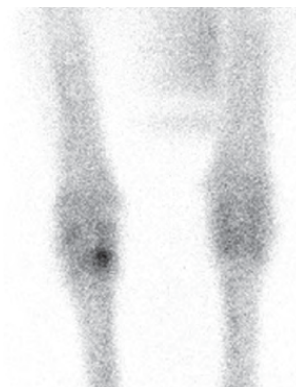
Fig 2. Increased radiopharmaceutical uptake in the right third carpal bone 3

Scintigraphy in horses offers unique information about the physiological status, and 99m Tc-MDP (methylene diphosphonate) is used commonly. It can be used in the diagnosis of the most lameness including stress fractures in legs, and the major advantage is an accurate imaging of the upper limbs, pelvis, and vertebral column without general anaesthesia 3 .