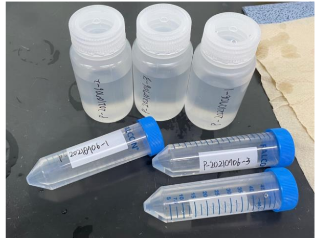
Fig. 2. Condensate samples to measure Uranium concentration and pH concentration

Also, three bottles of 100mm were collected to measure pH concentration without filtering. Fig. 2 is the photo of the condensate samples.