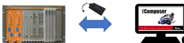
Fig. 3. Code composer debugging with JTAG

Code Composer is an integrated development environment (IDE) tool which is provided by Texas Instrument Inc. to develop TMS320 series processors. Code composer can be controlled by connecting with the target processor through JTAG.