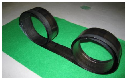
Fig. 4. U Foil produced by roll casting